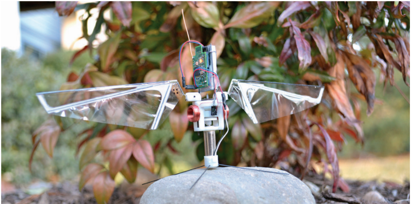
PAUL D. SAMUEL, DEDALUS FLIGHT SYSTEMS, LLC &amp; J. SEAN HUMBERT, UNIV. MARYLAND

An imitation insect, called a 'flapping wing micro air vehicle' does not resemble a bee, but it can hover in the air, turn rapidly and take off easily.